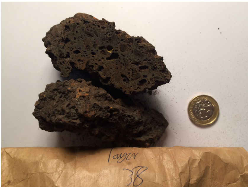
Slag sample, Context 38 - pit within channel fill.