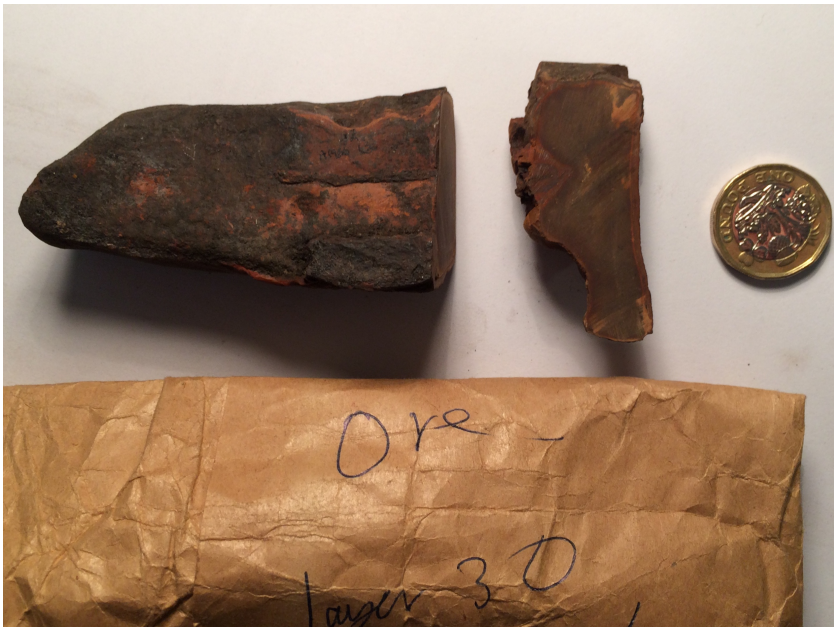
Ore sample, cross-sectioned for lab analysis.