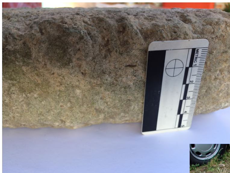
Green sandstone millstone fragment, Context 05.

This photo shows a millstone constructed from multiple pieces of stone. They would have been held in place by an iron rim.